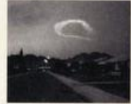
8:15 P.M., N. OF PHOENIX

On February 28, 1963, the event happened. A mysterious cloud floated across Arizona from the east to the west.