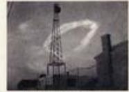
8:10 P.M., N.E. OF PRESCOTT